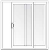
Two panel widths: 5', 6', 8'