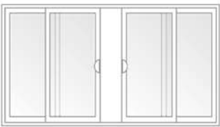
Four panel widths: 10', 12', 16'