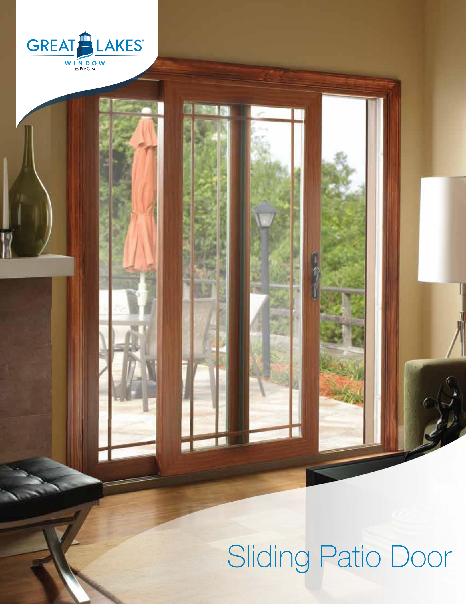
Sliding Patio Door