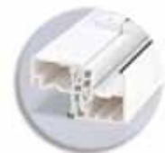
Meeting rails with integral sash interlock.

Beauty, Comfort, Value enjoy living in greater beauty and comfort, and increase your home's value today.