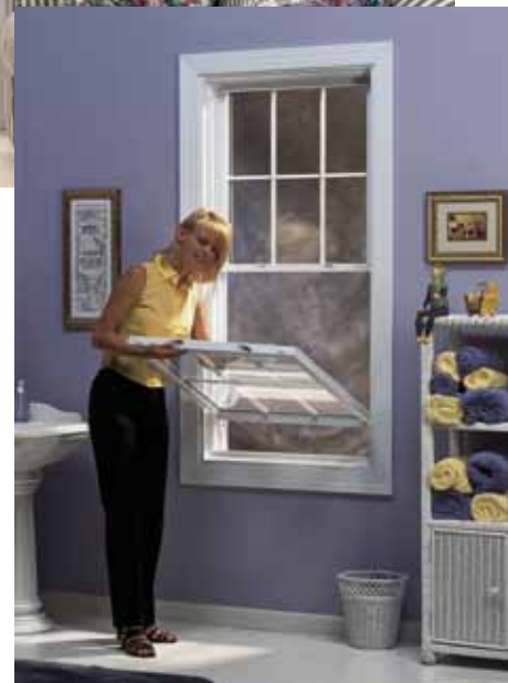
Our fusion welded double-hung windows offer beauty, maintenance freedom, and peace of mind at a price you can live with.