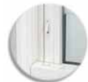
Ventilation limit latch and tilt-latch.