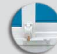
Optional security foot-bolt lock